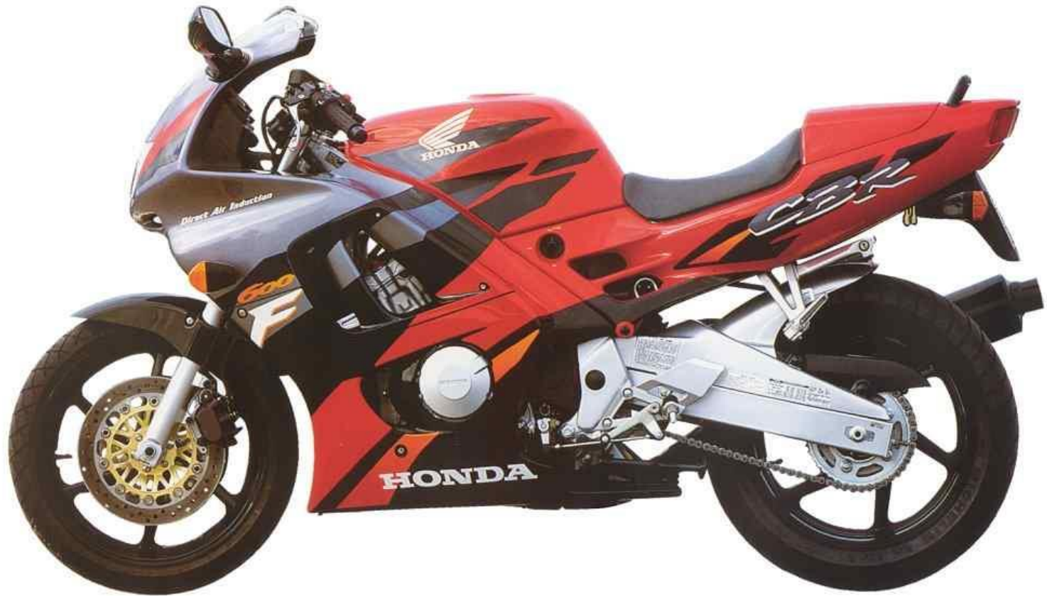
Honda CBR600F 1995